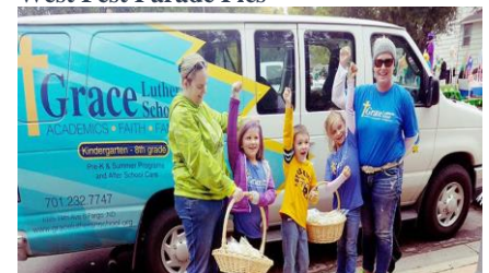
Getting ready for the parade route!