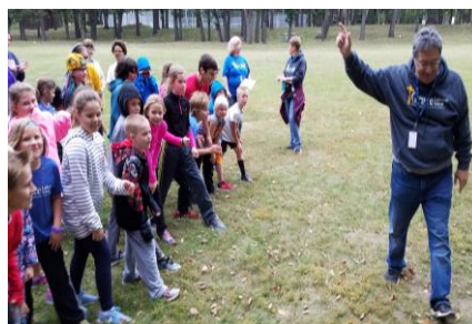
Jog-A-Thon pledges are due on Friday, September 22nd. Prizes and more fun to follow!