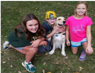
More quick snaps of Jog-A-Thon!